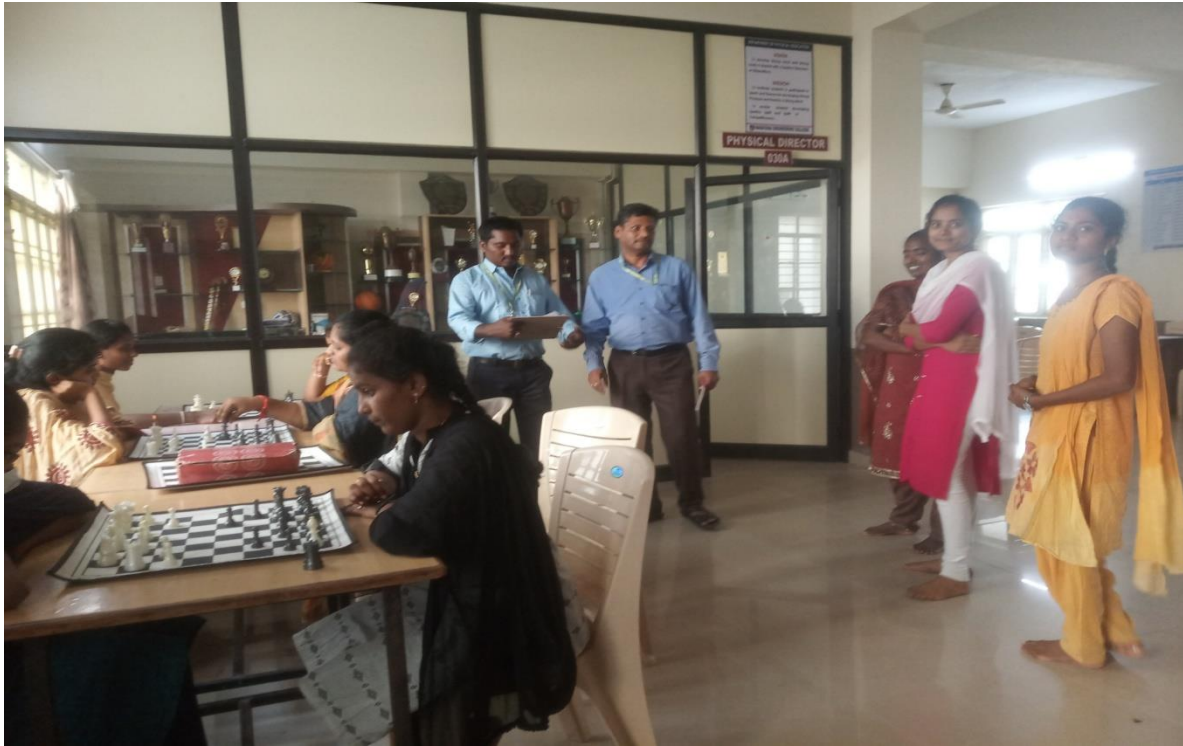
Girls Played Chess Competition