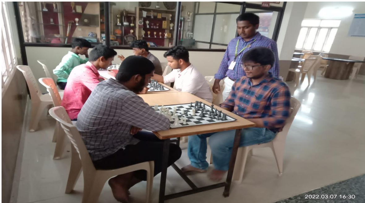
Boys playing in Chess Competition